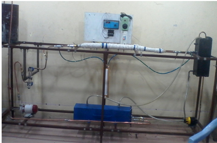
Fig.1 Experimental setup

The experiment is done using the water and Nano fluid and the following data's like inlet temperature, outlet temperature and discharge is obtained for both water and MWCNT. To obtain an optimum result the nanoparticles concentration is varied in the base fluid. With the obtained values from the experimental setup the following data's like thermal conductivity, density, Nusselt number, specific heat, Reynolds number, kinematic viscosity, dynamic viscosity and effectiveness of both water and Nano fluid is calculated.