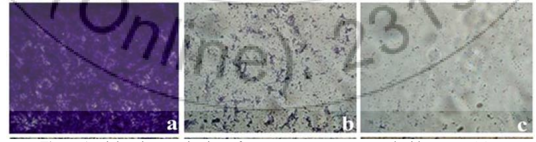
Figure 1: Light microscopic view of Serratia marcescens treated with Vitex trifolia . a. untreated control, b. treated with 50µg of extract, c. treated with 100µg of extract.

Biofilms are a highly dense matrix-encapsulated population which was attached to the surfaces [9]. The biofilm formation in S. marcescens is a major virulence factor which is controlled by Vitex trifolia. Biofilm has the ability to resist host immune response. It also resists conventional antibiotics. So, the control measures are required to prevent the biofilm formation in bacterial cells [9]. In the present study, biofilm images revealed that the Vitex trifolia extracts effectively disturb the biofilm formation as shown in light microscopic analysis. In this study Serratia marcescens was used as target pathogenic model to know anti-biofilm activity of Vitex trifolia. The influence of methanol extract of Vitex trifolia was assessed for its ability to inhibit biofilm formation in S. marcescens. The minimum inhibition of biofilm was 50µg/ml and maximum inhibition of biofilm was 100µg/ml. The order to analyze the antibiofilm efficiency of Vitex trifolia extract in inhibiting biofilm formation, S. marcescens cells were allowed to grow in MTP having glass slide in presence and absence of Vitex trifolia extract and the results were identified and visualized under a light microscope (Fig.1 & 2).