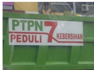
Figure 3: Trash Automobile, As a CBA Activity by PT Perkebunan Nusantara VII (Persero) Indonesia, 2018