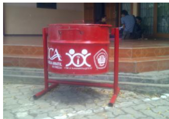
Figure 2: Trash Can, As a CBA Activity by PT Coca Cola Amatil Indonesia, 2018

on various consumer outcomes of CSR initiatives that also include attitudes toward a company (or brand), purchase intentions, CSR efforts, and CSR attributions.