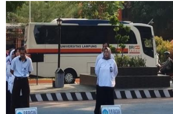
Figure 4: Students Transportation, As a CBA Activity by PT BNI 46, 2018