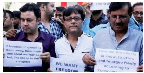
Fig.2:- Protest in Kashmir against media censorship

1. Kashmir Telecommunication, Mobile Data and Media Talks Suspension in Kashmir