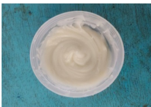
Figure 1: Formulated herbal ointment

Edema was created by injecting 0.1 mL of 1% w/v carrageenan in saline into the rat's right hind leg plantar side an hour before each experiment. Utilizing the index finger, lightly brush the planting region of the chest paw 50 times before applying 0.2 g of ointment. The mice in the control group established the proper baseline. As a benchmark, 1% indomethacin ointment, 0.2 gm, was employed. One hour was spent giving the medication or a placebo. Prior to administering Carrageenan. Use digital calipers to gauge paw volume at 1, 2, and 3 hour intervals right after injection. The amount of pain is indicated by the difference in thickness between the left and right paws, and the percentage of inhibition was calculated. 17-19