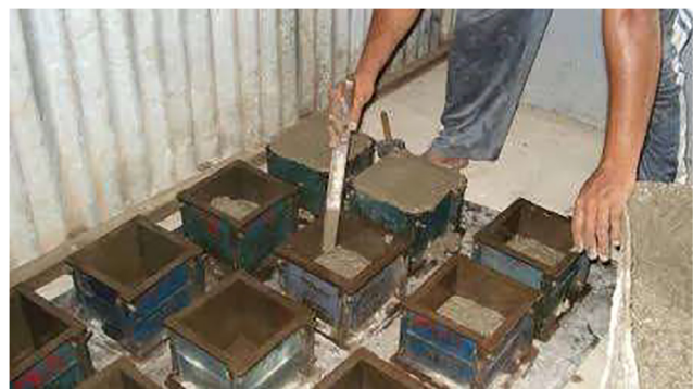
Fig. 3. Cube casting for experiments.