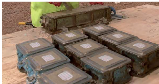
Fig. 4. Casted cubes for testing.

ural fibre called sisal. The sisal fibre is extracted from a desert plant called cactus [42]. The application of sisal fibre is traditionally used for rope and twine, and has many other uses, including paper, cloth, footwear, hats, bags, carpets, and dartboards [43–45]. In this project we are incorporating sisal fibre in concrete with various propositions.