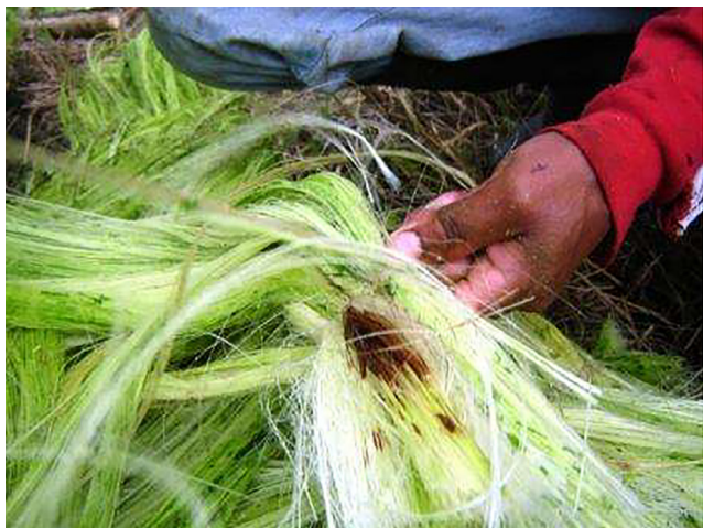
Fig. 1. Extraction of sisal fibre.