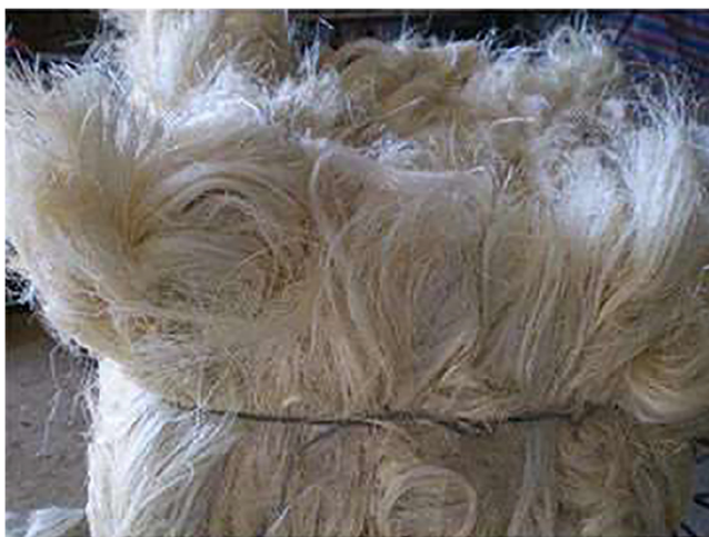
Fig. 2. Fibre exacted from cactus plant.