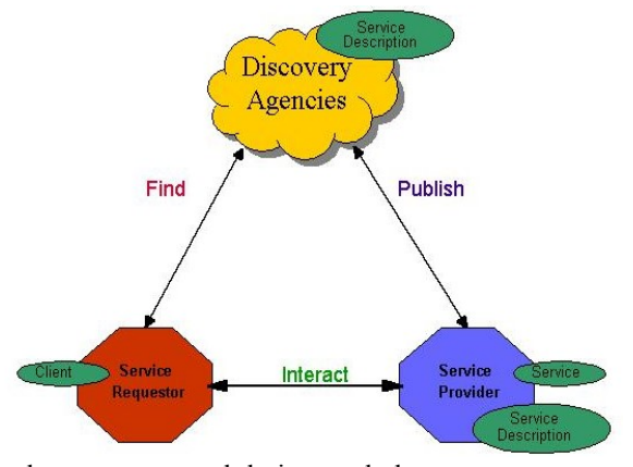
enhancement, modularity and heterogeneous system integration.

is nothing but SOA which has addressed many challenges features namely dynamism, distributed