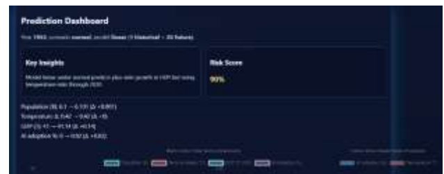
Fig 6. Prediction dashboard