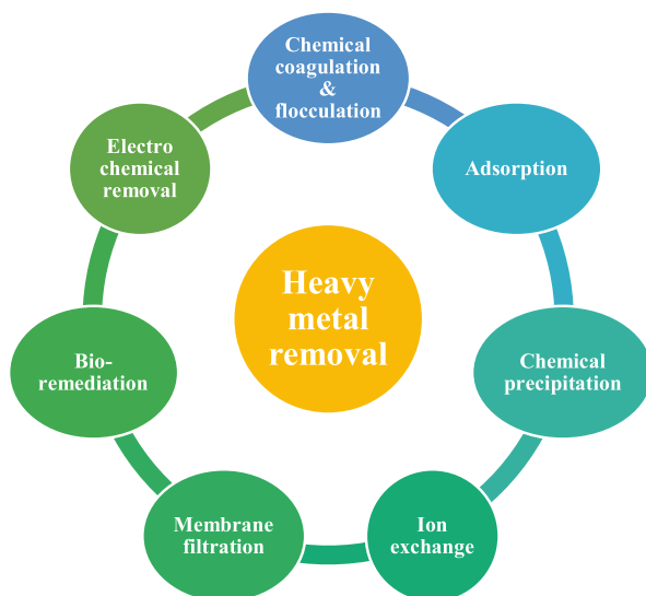
Fig. 1.1 Conventional heavy metal contamination remediation techniques

Bioremediation: Using plants, animals, and microorganisms for the toxic heavy metal removal from polluted soil and waste waters is a sustainable approach with prolonged environmental benefits at low cost (Dixit et al., 2015). A number of writers have recently used phytoremediation and bioremediation. Living things are known to detoxify harmful substances in the environment. Remediation techniques with treatment removal efficiency, economic and environmental viability, etc. However, the conventional treatments (Fig. 1.1) for heavy metal remediation are discussed below.