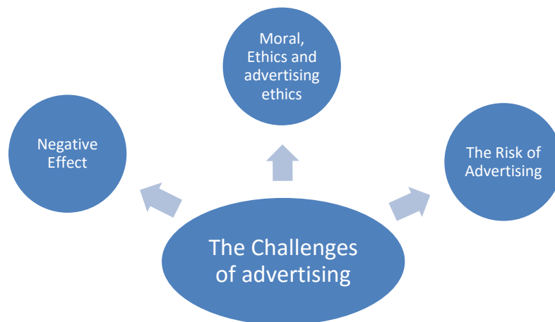
Challenges of Advertising

Job Dubihlela, 2011 suggested that Advertising experts must be aware that behavioural attitudes are contentious and always changing. Customers hold various attitudes about advertising ethics, and these beliefs may shift as different things offend different people.