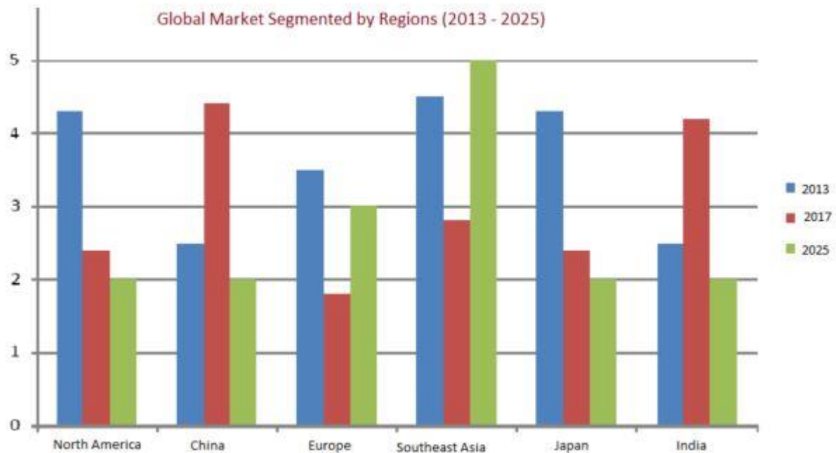
Figure. 2; Rise of Luxury Hotels