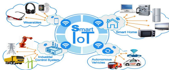
Figure 1: Illustration of smart IoT applications

The quantum threats to cryptography apply equally, or even to a greater extent, to smart objects extensively used in smart IoT services since they involve platforms and systems which are difficult to update. For example, embedded devices in wearables and furnitures are difficult to update and the scalability issue in IoT devices further complicates the problem. Therefore, we should taken into consideration post-quantum security when designing secure architectures and systems for smart IoT, now.