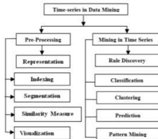
Figure 1: Overview of Time Series Analysis

Figure 1 illustrates the overview of time series analysis using data mining technique. It involves preprocessing and respective techniques to support it. Under preprocessing we have representation, indexing, segmentation, similarity measures and visualization technique. Rule Discovery, Classification, Clustering, Prediction and Pattern mining comes under mining of time series technique. A time series T is an ordered sequence of n real-valued variables T = (t_1, \dots, t_n) , t_i \in \mathbb{R} . Since time series is a kind of an underlying process in the course of which values are collected from measurements made at uniformly classified time instant for a given sampling rate. In other words, it can be defined as a set of contiguous time instants that can be univariate or multivariate when several series simultaneously span multiple dimensions within the same time range. Time series data covers the whole set of data generated through observation process. In the case of streaming, they are semi-infinite as time instants continuously feed the series. Thus, it is better to consider only the subsequences of a series 2 .