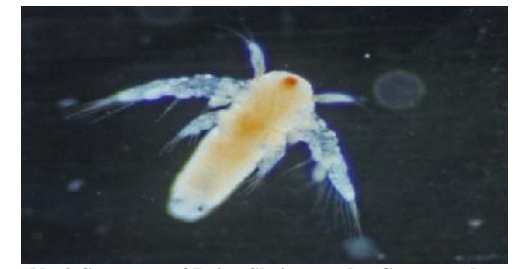
Figure No-2-Structure of Brine Shrimp under Compound Microscope