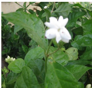
Figure 1. Jasminum sambac (L.) Ait.

The plants used in this study Jasminum sambac (L.) Ait. (Figure. 1) No.BSU/SRC/5/23/2011-12/Tech-133 (Oleaceae), was collected from Namakkal District, Tamil Nadu. It was authenticated at Botanical Survey of India, South Circle, Coimbatore, Tamil Nadu. Herbarium is maintained in the Department of Biotechnology, Karpagam University, Coimbatore, TamilNadu.