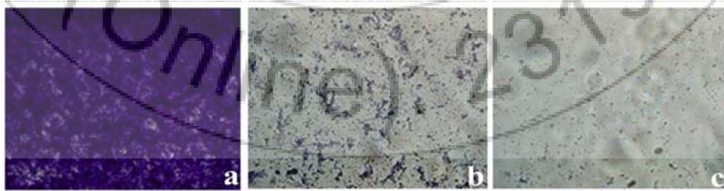
Figure 1: Light microscopic view of Serratia marcescens treated with Vitex trifolia . a. untreated control, b. treated with 50 \mu\text{g} of extract, c. treated with 100 \mu\text{g} of extract.

Biofilms are a highly dense matrix-encapsulated population which was attached to the surfaces [9]. The biofilm formation in S. marcescens is a major virulence factor which is controlled by Vitex trifolia . Biofilm has the ability to resist host immune response. It also resists conventional antibiotics. So, the control measures are required to prevent the biofilm formation in bacterial cells [9]. In the present study, biofilm images revealed that the Vitex trifolia extracts effectively disturb the biofilm formation as shown in light microscopic analysis. In this study Serratia marcescens was used as target pathogenic model to know anti-biofilm activity of Vitex trifolia . The influence of methanol extract of Vitex trifolia was assessed for its ability to inhibit biofilm formation in S. marcescens . The minimum inhibition of biofilm was 50 \mu\text{g}/\text{ml} and maximum inhibition of biofilm was 100 \mu\text{g}/\text{ml} . The order to analyze the antibiofilm efficiency of Vitex trifolia extract in inhibiting biofilm formation, S. marcescens cells were allowed to grow in MTP having glass slide in presence and absence of Vitex trifolia extract and the results were identified and visualized under a light microscope (Fig.1 & 2).