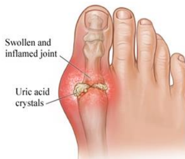
Fig 1: The image shows the uric acid crystals and inflamed joints [6]

Gout is a disease where Mono Sodium Urate (MSU) gets accumulated in synovial fluid and other tissues and multiple areas in the bones. It is the most debilitating disease [1]. Accumulation of mono sodium urate crystals forms inflammatory conditions in a body. Hyper-uricemia is one of bacterial deficiency in gout [2-3]. Mono Sodium Urate crystals can accumulate uric acid crystals in all tissues and nearby the joints. It is detected by recognizing the characteristic of MSU crystals by fluid joint. NSAIDs or colchicines are used to cure acute joint swelling fastly. The main objective in controlling of gout, by using the reduced SUA levels drugs [4-5].