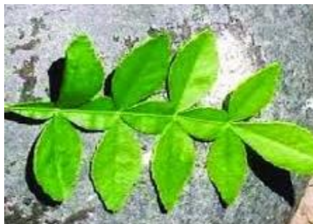
Fig. 1: Leaves of Aegle marmelos

Aegle Marmelos is a species of tree native to India and it belongs to the family Rutaceae 20-21 . It is commonly known as Bael, Golden apple, and Bengal quince which is seen throughout South East Asia. The fragrant leaves and fruit of the plant have medicinal value and were used to treat dyspepsia and sinusitis. Leaves of the A. Marmelos contain alkaloids of which aegeline (N-[2-hydroxy-2(4-methoxyphenyl)ethyl]-3-phenyl-2-propenamide) is a known constituent and is consumed as a dietary supplement.