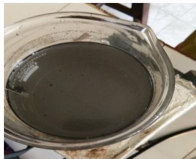
Fig. 2: View of MWCNTs prepared in our lab

We have followed a similar procedure employed in our previous paper (Rani et al. 2018) for the preparation of MWCNTs. In a clean 500ml beaker, a mixture of 30ml of concentrated nitric acid and 60 ml of concentrated sulphuric acid were taken. To this acid mixture about 5g (0.4166mol) of 99.9% graphite was added slowly with stirring for about 30 min. Once the addition of graphite is done, the solid-oxidant potassium persulphate [ 128g (0.473mol)] was added steadily for about 50 min with constant stirring. As this reaction is an exothermic one, a lot of heat was produced while adding potassium persulphate into the mixture. Therefore, special care must be taken during this step. Following this, the resultant mixture was heated for 3 h at 110°C and kept as such for 24 h at room temperature. After 24 h, the entire content was then added into 1 litre of Millipore water and stirred well with the help of magnetic stirrer fastly for one and half hour. The top floating layer (of MWCNTs) was collected separately with extreme care, washed with water repeatedly, filtered and dried. The CNTs prepared in the reaction mixture is given in the Figure 2.