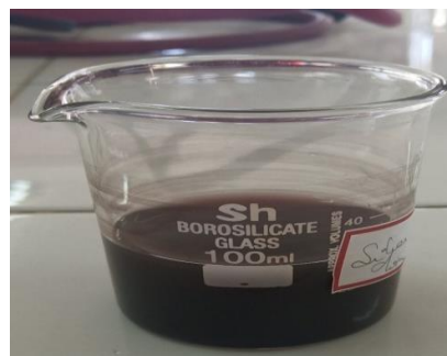
Fig. 3: Silver-doped MWCNTs as suspension in water

Silver nanoparticles prepared as above by the green synthesis (15mg) were added into Multiwalled carbon nanotubes (100mg) taken in a 100ml RB flask. About 50ml of distilled water was added into the reaction mixture and heated to 70°C and the mixture was continued to be kept at the above temperature for further 3 h with constant stirring. The product formed (Figure 3) was cooled to room temperature and filtered washed with distilled water for multiple times and dried.