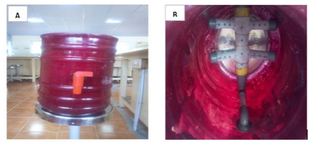
Figure 1: Picture of the model (A) View of Outer set up (b) View of Inner pipeline

Adsorbent material with large surface area is used to remove all the impurities present in the waste water. The Treated water contains Aromatic compounds and Heavy metal ions concentration within the permissible limits to human. After treatment the TDS content is reduced to about 60% and the turbidity is reduced to 80% when compared with the initial concentration. The water can be used for domestic purposes in house and for cooling purpose in industries.