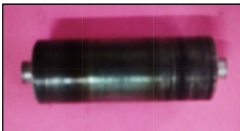
Fig. 2. FSW Tool.

The spindle rotational speed range between 800 rpm – 1200 rpm and the Traverse speed is 1.66 mm/sec and 2.5 mm/sec, Axial power of 8x10 3 N the two sides welding was carried. Aluminium AA6063-T6 and AA 7075- T5 compounds are joined adequately by strong state joining strategies utilizing different Tool