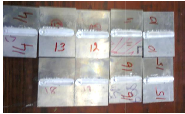
Fig. 3. FSW Welded Specimens.

turn speeds. The enhancements in the mechanical way of behaving to be identified, ultimate extension assessment/rigidity of the weldments and hardenability of weldments assessed at work testing will be one-sided by the device revolution speed, feed & axial force. The response of the instrument rotational rates and feed towards a definitive rigidity and solidify capacity of the welded joints were established obviously.