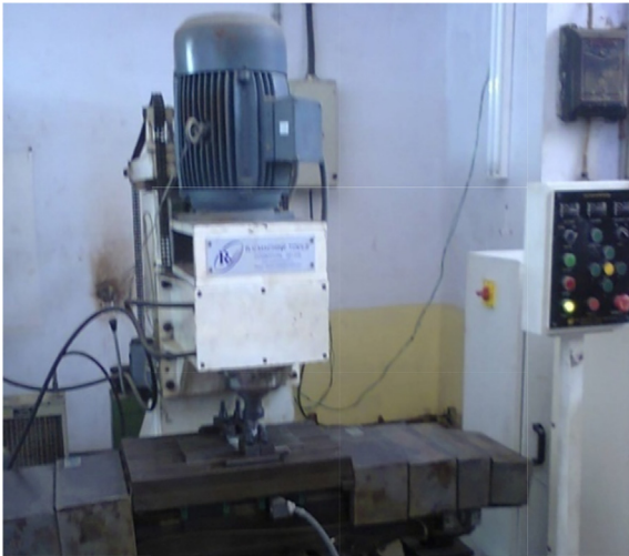
Fig. 1. FSW Equipment setup.

combinations AA6082 are welded utilizing FSW. The Tensile properties and hardness were researched. In this study, a thermal model of the grating mix-welding process was repeated for the AA6082 plates and the intensity created during the cycle is determined by the numerical articulation [8]. The Heat worth of 880 W was determined for the welding speed 1000 rpm, 2.5 mm/sec and 8 KN by utilizing numerical articulation [9,10]. The Friction stir welding tool is shown in the Fig. 2 and the friction stir welded composite specimens are shown in Fig. 3.