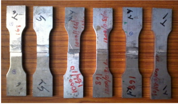
Fig. 4. Tensile strength tested specimen.