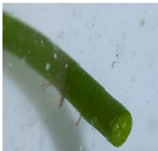
Figure 1: The Noodle grass of Syringodium isoetifolium

They are rapid asexual colonizer of disturbed plots and have the fastest growth of horizontal rhi-