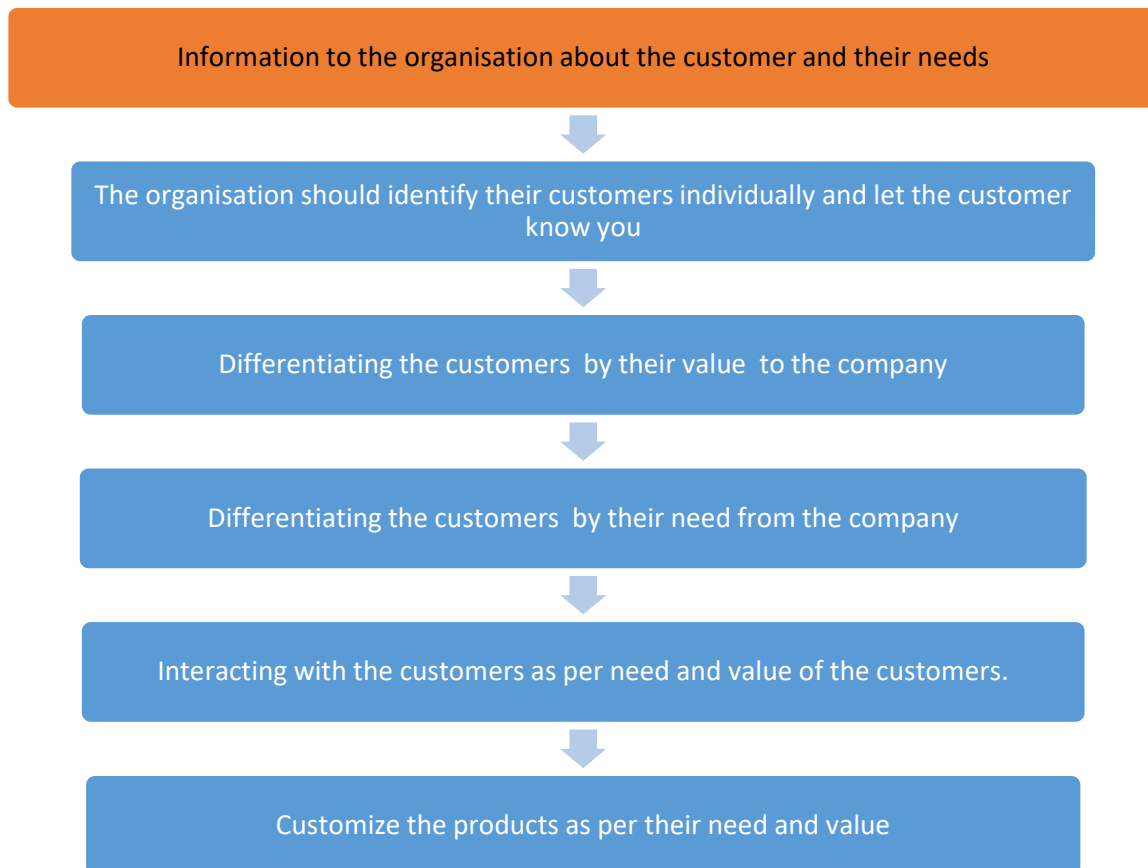
Figure 1: CRM Model SOURCE -IDIC MODEL (Shruti Thakur and Priya Chetty, 2019)

The CRM model states that the first organisation should obtain the information about the customers. The organisation at first should identify their customers individually and also allow the customer to know your customers. The next step is to differentiating the customers by their value to the company. The most valued customer should be placed top and always give a preference to such customers. The next step is that the company should differentiate the customers by their need from the company. Then the company should interact with the customers as per need and value of the customers. After conducting all this steps, the company should customize their products as per the need and value of the customers. By following all this steps the company can formulate and implement the CRM effectively and efficiently, which will benefit the company by the way of customer satisfaction and loyalty. This will also help in retention of the customers.